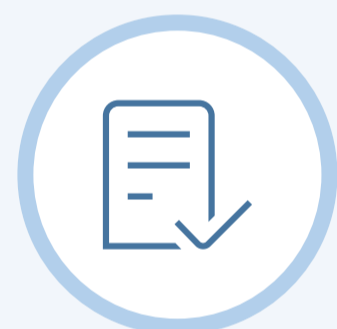
Photo (white background)

Originals of diplomas, work experience certificates, criminal record certificate (with apostille/legalization + translation into Chinese)